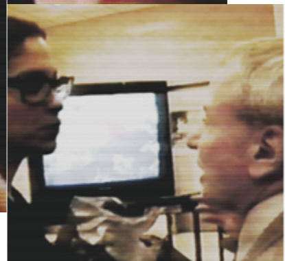
Installazione video a cura di Umberto Scrocca e Freddy Grunert